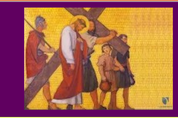
Stations of the Cross: Fridays during Lent 3.00pm (in Italian) 7.00pm (in English)

Durante il Periodo Quaresimale ci saranno stazioni della Croce Ogni venerdi a 7.00pm in inglesi eda 3.00pm ( in italiano) nella Chiesa.